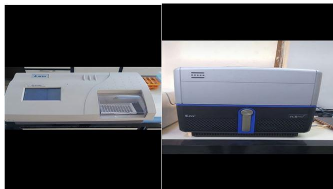
Fig.2: Polymerase Chain Reaction PCR device used in the study

Salivary glands were removed to measure the tissue's acetylcholine esterase gene using Polymerase Chain Reaction (PCR) machine (fig 2). Salivary gland samples were put in a buffered phosphate solution for analysis. After 30 days of the administration, two hours following the last treatment, the animals in each group were put under light ether anesthesia and sacrificed.