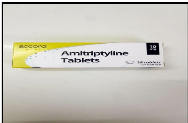
Fig.1: Amitriptyline tablet used in this study

Ashwagandha root extract was available in powder obtained from Naturalaya Kimya company/Antalya /Turkey. (Fresh aqueous solution of Ashwagandha was prepared and administered orally every day. ( Rats treated orally by oral gavage needle with 0.5 ml aqueous of Ashwagandha root extract (100 ml water +5000mg plant) at a dose of 200 mg \ kg body weight (50 mg/rats) for 30 days (Mahmoud et al. , 2022). Amitriptyline was available in the form of tablets from accord company United Kingdom. (Fresh solution of amitriptyline was prepared and administered orally every day (Fig.1).