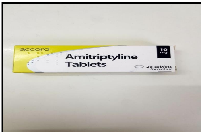
Fig.1: Amitriptyline tablet used in this study

Ashwagandha root extract was available in powder obtained from Naturalaya Kimya company/Antalya /Turkey. (Fresh aqueous solution of Ashwagandha was prepared and administered orally every day. ( Rats treated orally by oral gavage needle with 0.5 ml aqueous of Ashwagandha root extract (100 ml water +5000mg plant) at a dose of 200 mg \ kg body weight (50 mg/rats) for 30 days (Mahmoud et al. , 2022). Amitriptyline was available in the form of tablets from accord company United Kingdom. (Fresh solution of amitriptyline was prepared and administered orally every day (Fig.1).