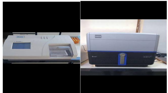
Fig.2: Polymerase Chain Reaction PCR device used in the study

Salivary glands were removed to measure the tissue's acetylcholine esterase gene using Polymerase Chain Reaction (PCR) machine (fig 2). Salivary gland samples were put in a buffered phosphate solution for analysis. After 30 days of the administration, two hours following the last treatment, the animals in each group were put under light ether anesthesia and sacrificed.