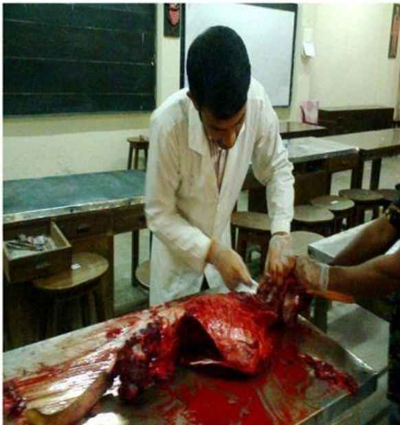
Fig.1: Skinning, Evisceration, and Separation of different body parts.

Separated the animal body into different parts: fore-limb, hindlimb, skull with vertebrae, ribs & sternum, and pelvic bone (Fig. 1). Fore-limb, hindlimb, and pelvic bone are packed in a nylon mesh with an identified marker to avoid mixing. A thin wire (1 mm) was driven through the vertebral column to the skull to keep the natural order of vertebrae from skull to tail. Ribs and sternum are tightly knotted serially by a copper wire (0.5 mm) in situ position of the skeleton and gently pulled away from the backbone.