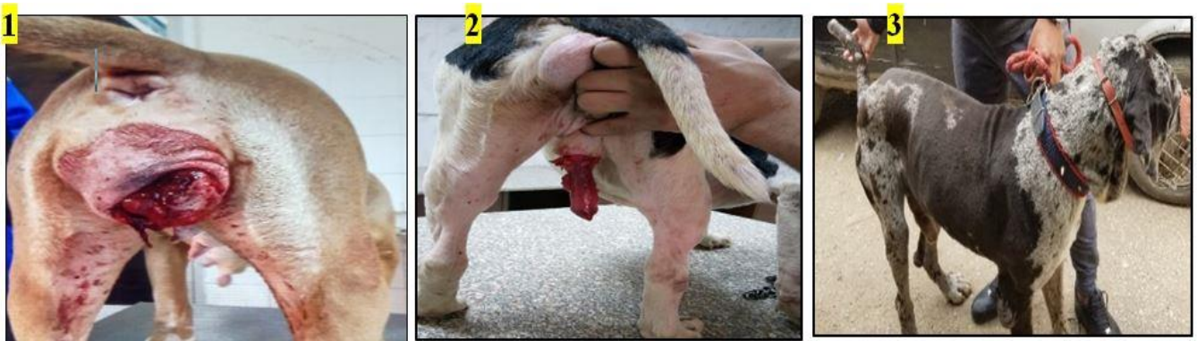
Fig. 1: Bitch showing, hemorrhagic cauliflower-like vaginal genital transmissible venereal tumor protruding from the vulva.