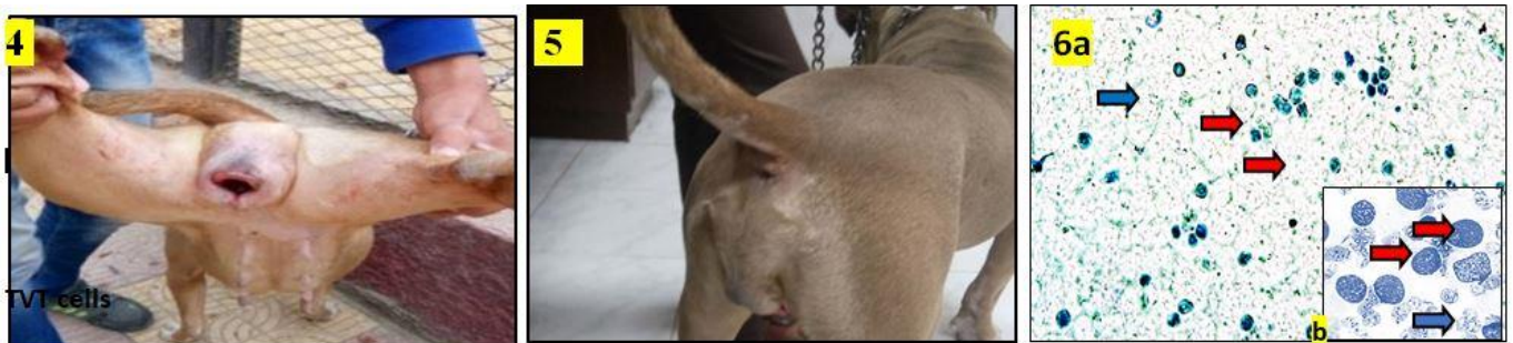
Fig. 4: Bitch of (G1), showing, and partial remission (PR) first week after administration of vincristine sulfate.