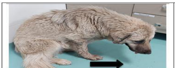
Figure 1: Hyper salivation (black arrow) and lethargic status of the dog with labored respiration

Physical examinations including palpation of lymph nodes, measurement of heart and respiratory rate and temperature, auscultation of lung and heart, evaluation of color of mucous membranes, capillary refill time, degree of dehydration, ECG (Biocare ECG 300G, China) and MGCS assessment to determine the level of consciousness were performed. Laboratory analysis included blood gases (ABL80 Flex, Denmark), complete blood count (CBC) (MS4 Autoanalyzer, France) and serum biochemistry (BT3000 Autoanalyzer, Italy) measurements.